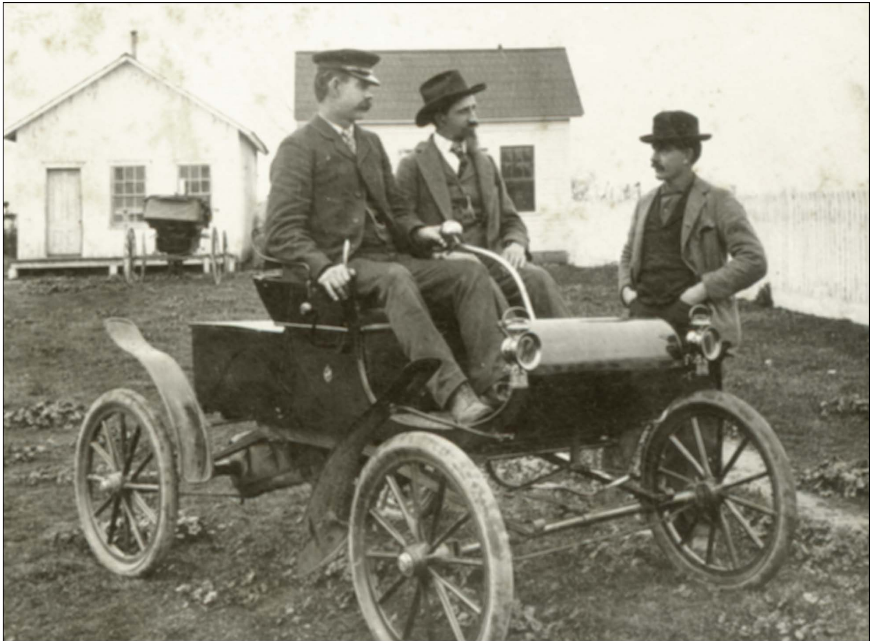
Figure A-1. The distinctive rounded front panel and logo on the side indicates this most is probably a 1901-03 Oldsmobile.

Every car manufactured is not included in this Appendix, though the most common ones are shown. You can see that styling trends were similar, if not copied, between manufacturers.