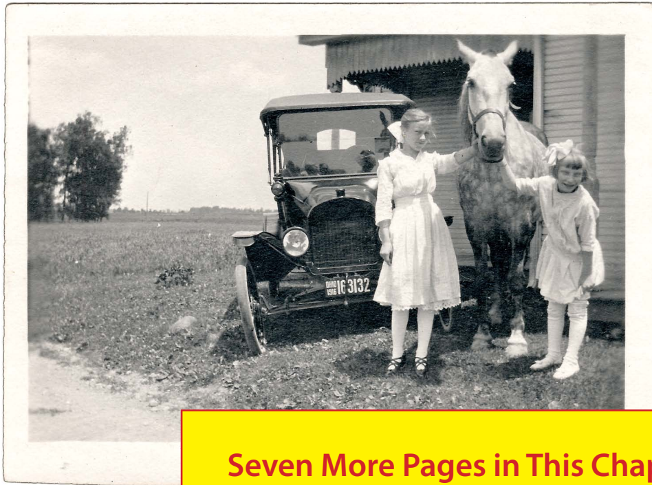
Figure A-4. This 1916 snapshot ironically contrasts the old mode of transportation with the method to soon dominate the world. These young girls would see dramatic changes over the course of their lives.

structures were now available on the most up-to-date models, especially late in the decade. Touring and sport models were still available with fold-down canvas enclosures into the 1920s as well, as the convertible style never did die off