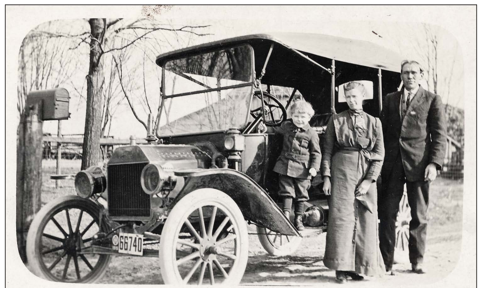
Figure A-5. 1910 - 1913 Ford. The models did not change much from year to year. The introduction of new models became as much a marketing ploy as a technical or product necessity.