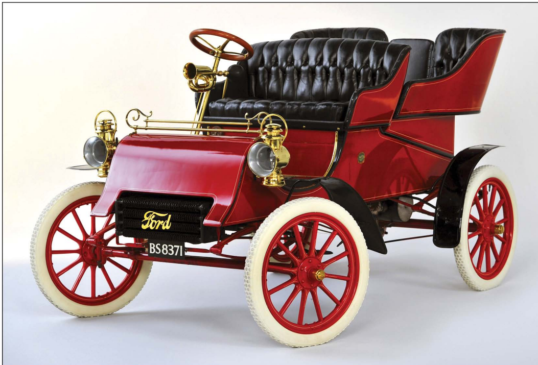
Figure A-2. 1903 Model A Ford. First production car by Henry Ford. It was hand built, not on an assembly line.

Most early models were open cockpit or protected with a canvas covered metal frame that could be folded back, similar to those still used on horse-drawn buggies.